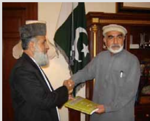
Governor of Balochistan metes of Ombudsman of Balochistan

Balochistan Governor also praised the report submitted to the Supreme Court of Pakistan on the reference on allotment of