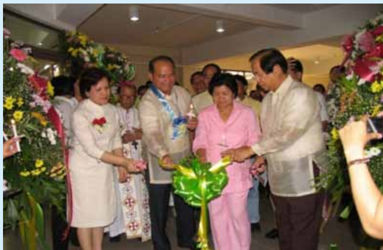
The office of the Ombudsman Inaugurates “dulugang Bayan” In Luzon.