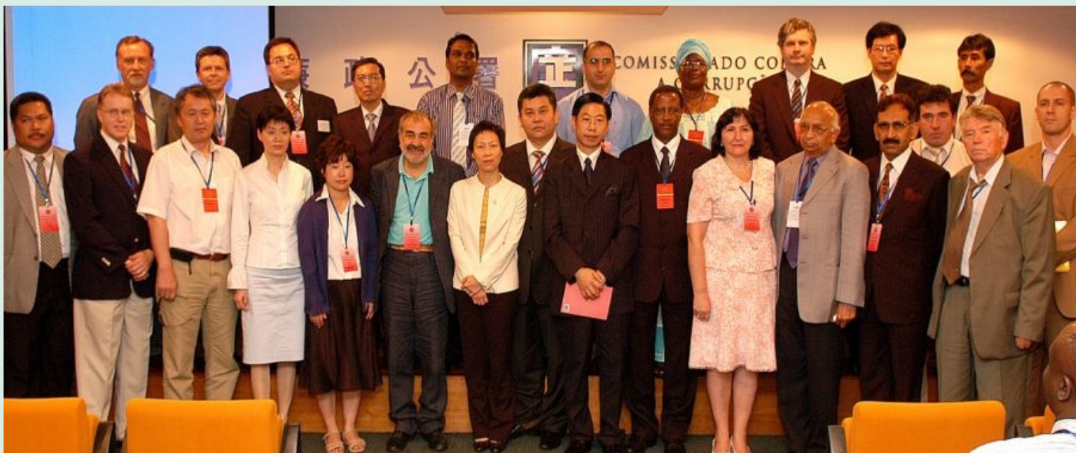
The IAACA delegates visiting the CCAC