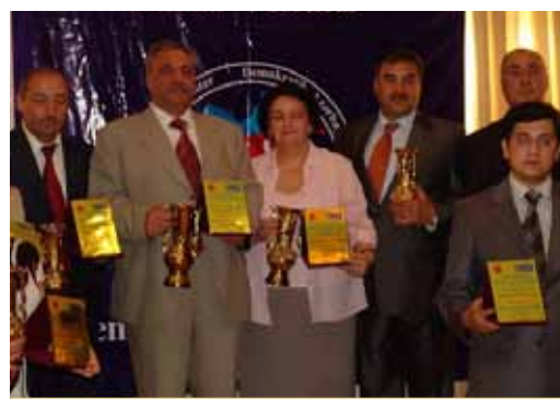
Office of the Ombudsman of the Republic of Azerbaijan

Organization committee of the "Democratic Azerbaijanis" Public Centre conducted its following public inquiry for the independent award "Golden Buta" in the country and the names of the winners were made public on the basis of the inquiry.