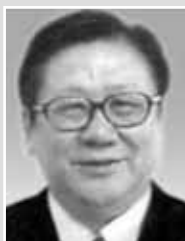
Minister Li Zhilun

The General Assembly and Board of Directors of the AOA express their grief and condolences on the sad demise of Mr. Li Zhilun, the Minister of Supervision, People's Republic of China. Mr. Li was an invaluable member of the AOA and his contribution to the cause of the AOA and the promotion of Ombudsmanship in Asia have been widely acknowledged. Mr. Li was laid to rest in Beijing, after his death due to an illness on April 28th. Mr. Li was 65.