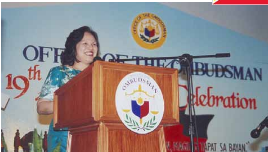
Ombudsman Ma. Mercedes N. Gutierrez reports on the achievements of the Office of the Ombudsman after her almost one and half years in office. The Office of the Ombudsman celebrated its 19th Anniversary Celebration last May 4 with the theme “Korupsyon ay Labanan, Maging Tapat sa Bayan.”

“People should not treat the work of the Ombudsman as that of politicians who are concerned with political timing, political cost and benefits. The only timing the Ombudsman is concerned with is ‘will the respondents’ continued presence in office jeopardize the investigation?’ If the answer is yes, then that is when the suspension must be ordered and implemented. When we ordered the suspension of two mayors in Southern Visayas several weeks ago, we did not hear of anyone saying the orders were ill-timed.”