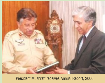
President Musharraf receives Annual Report, 2006