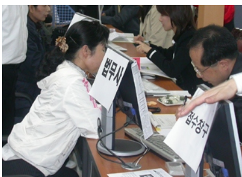
In on-site counseling for foreigners, the Ombudsman of Korea finds period of sojourn and reentry worry migrant workers